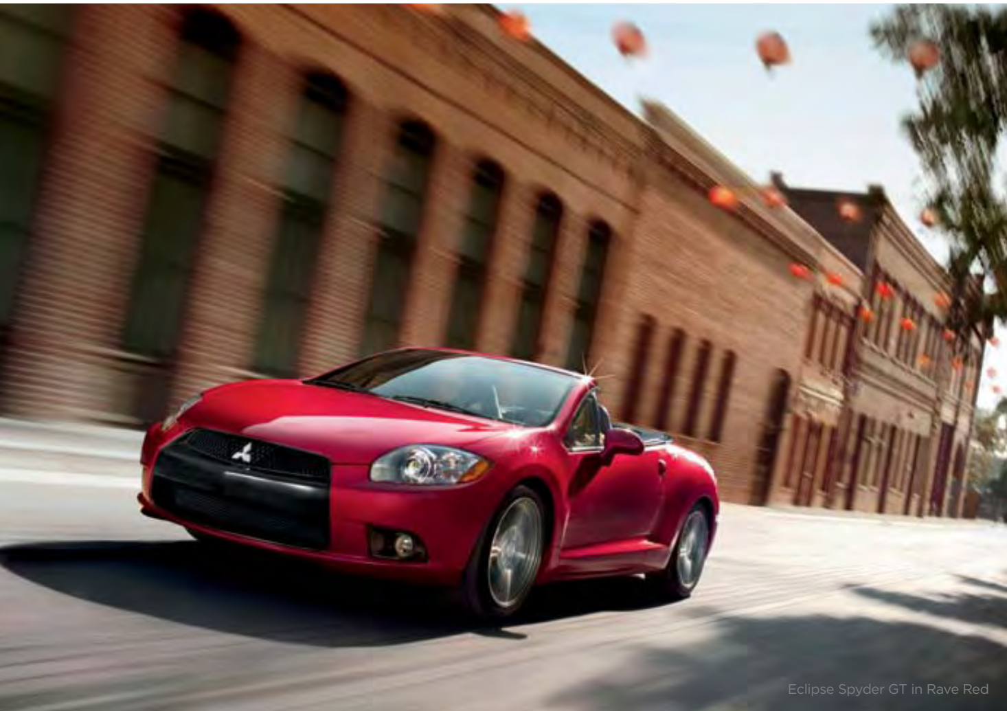
Eclipse Spyder GT in Rave Red