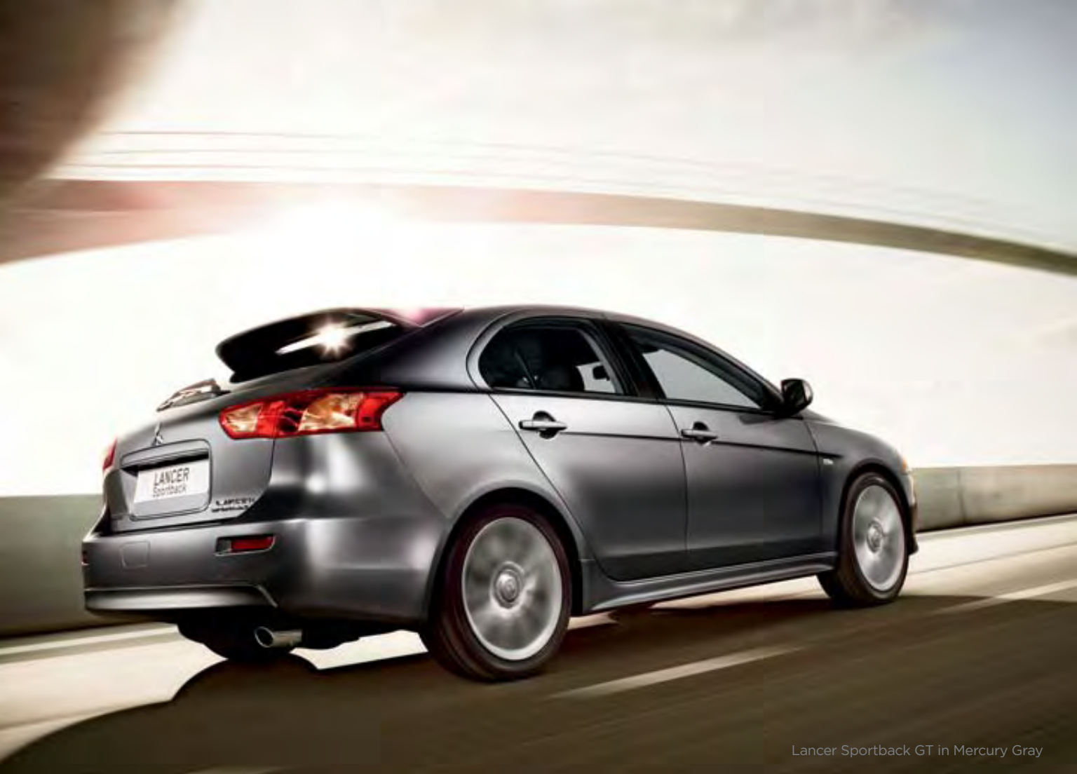
Lancer Sportback GT in Mercury Gray