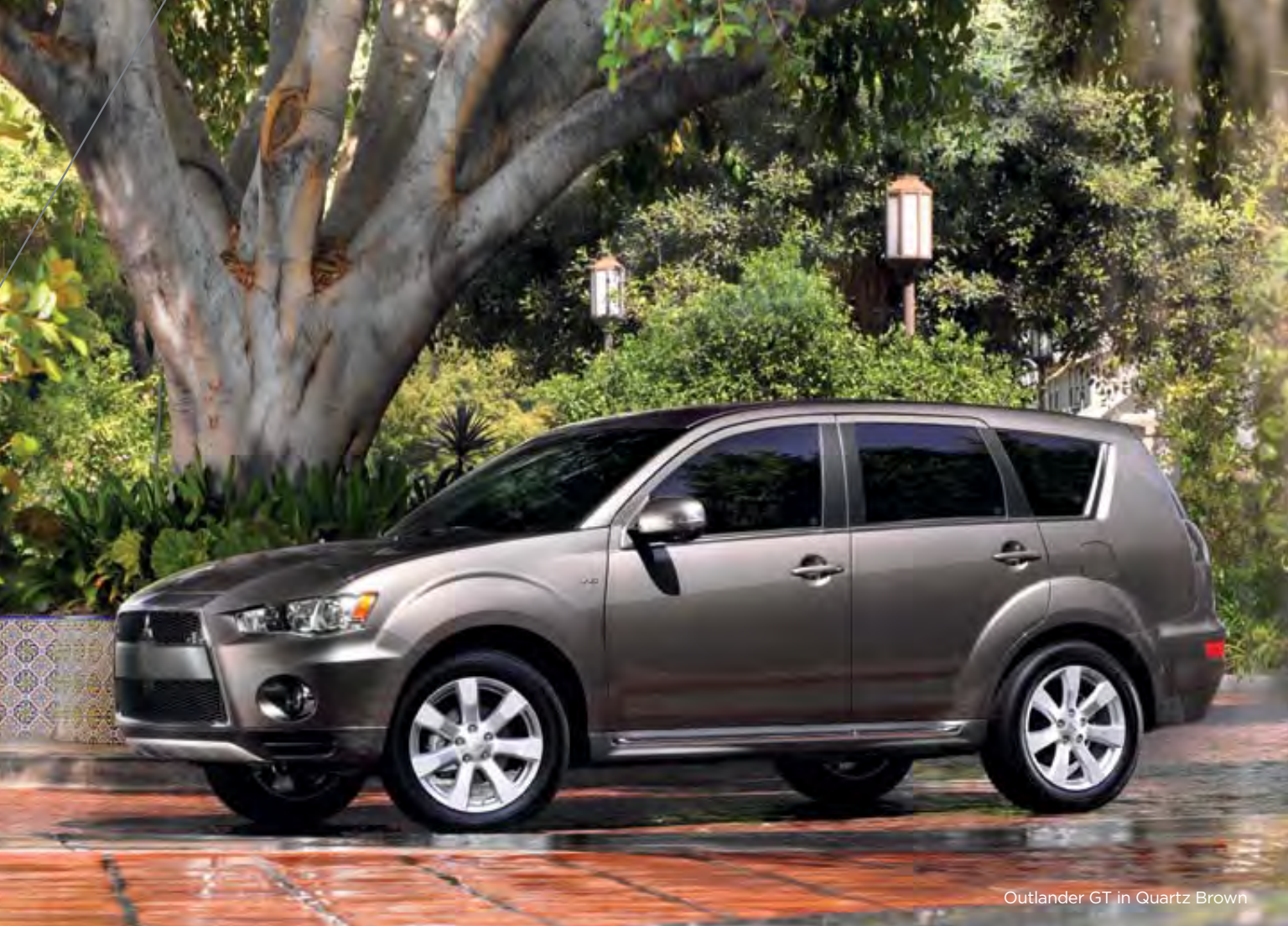
Outlander GT in Quartz Brown