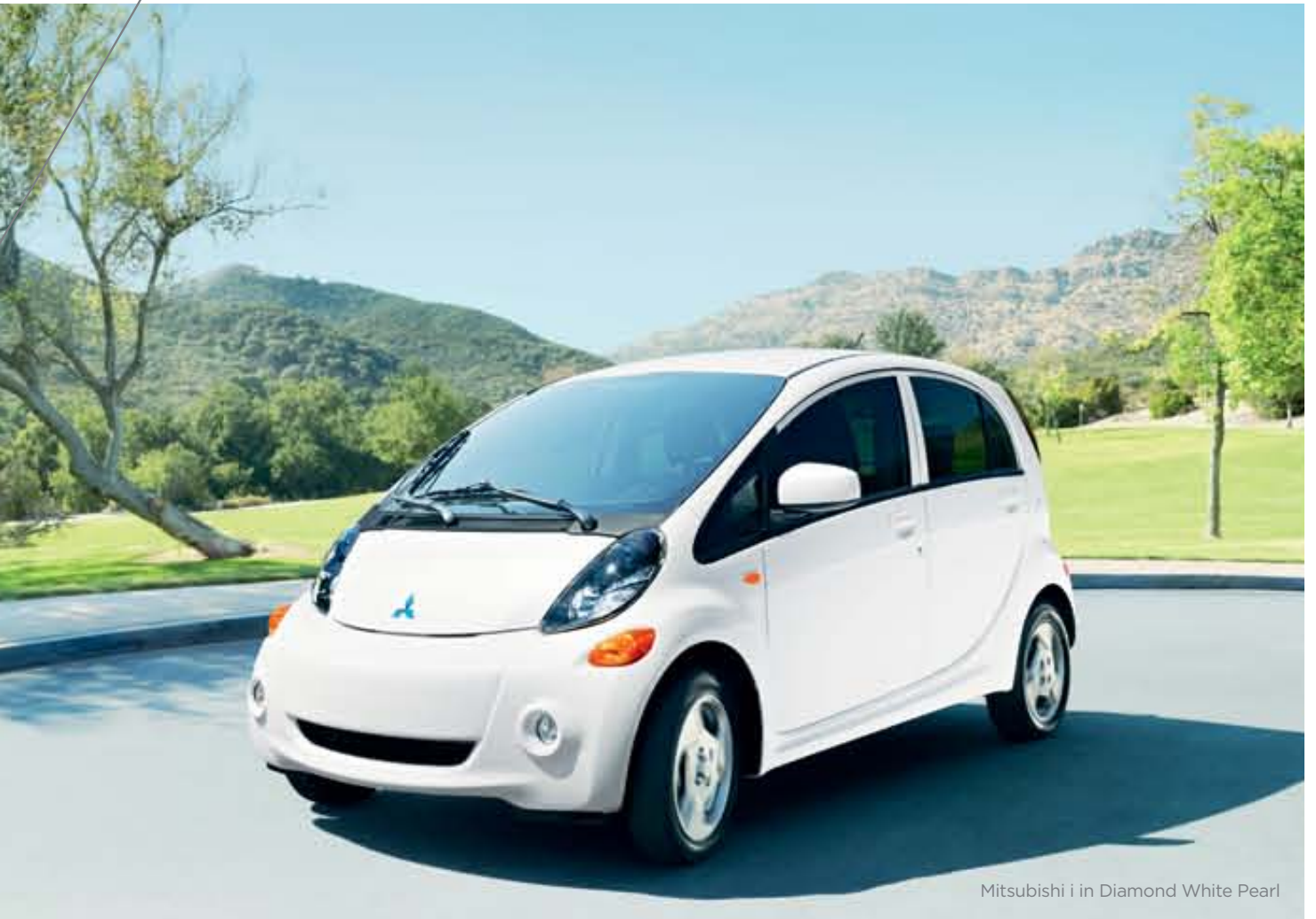
Mitsubishi i in Diamond White Pearl