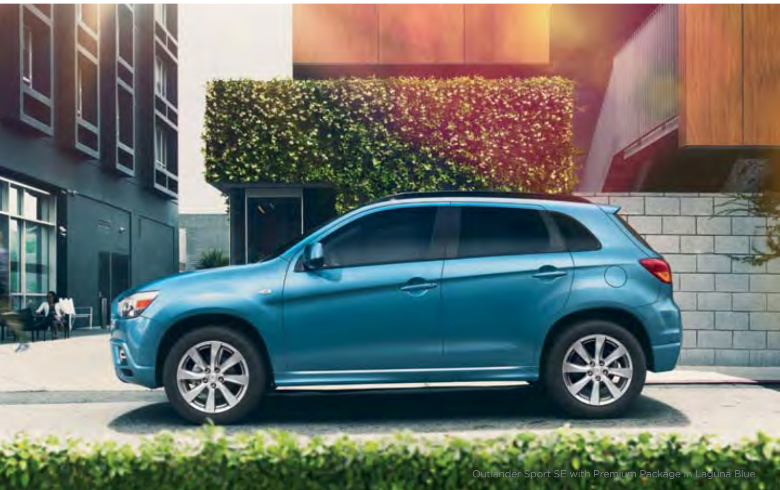
Outlander Sport SE with Premium Package in Laguna Blue