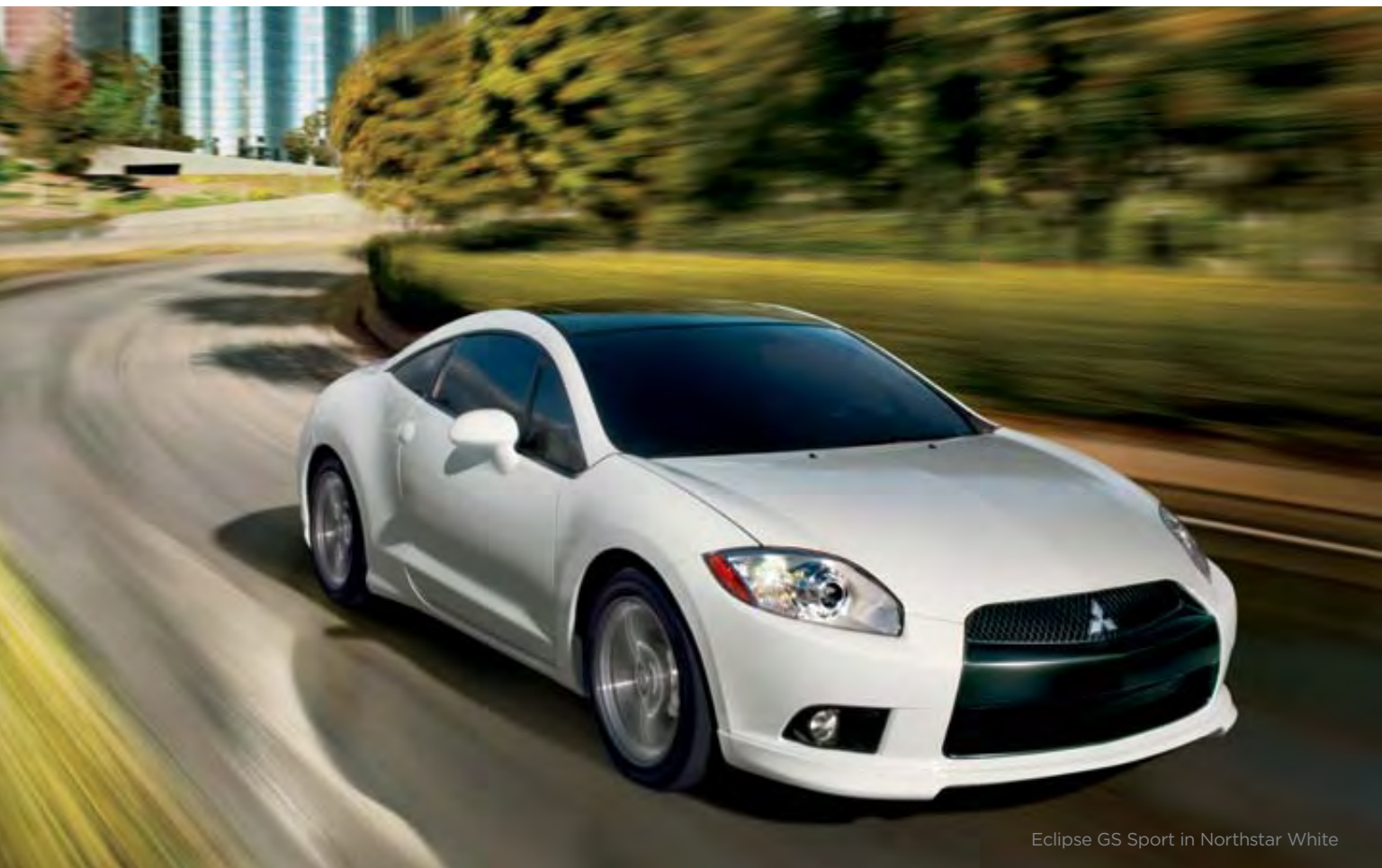
Eclipse GS Sport in Northstar White