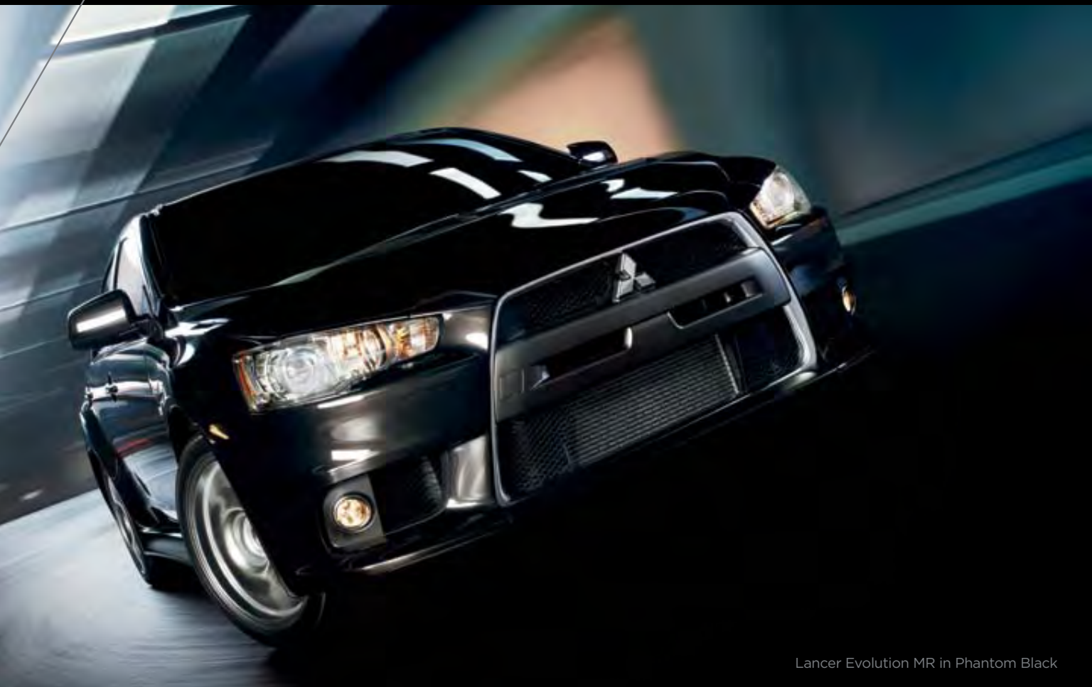
Lancer Evolution MR in Phantom Black