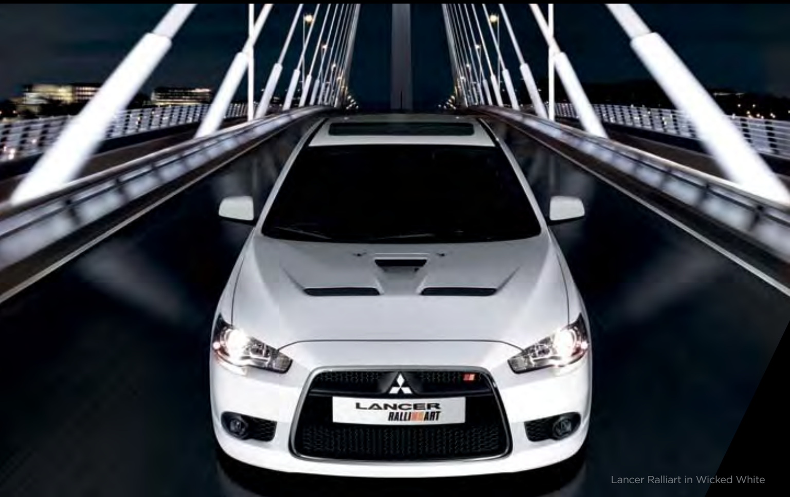
Lancer Ralliart in Wicked White