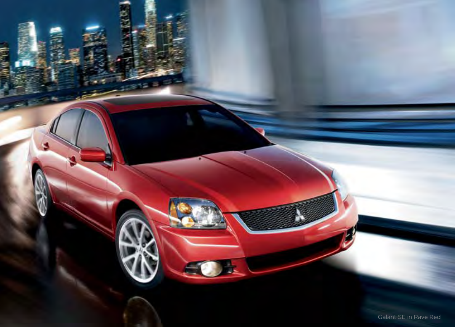
Galant SE in Rave Red