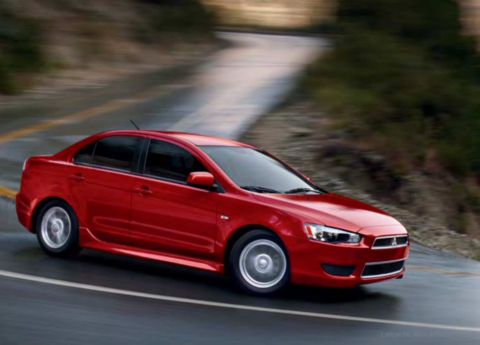
Lancer SE AWC in Rally mode