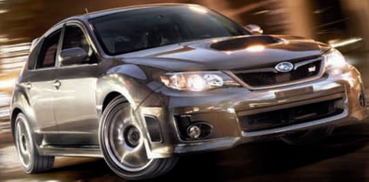
WRX STI 5-door in Dark Gray Metallic.

"The Impreza WRX STI is a rally-bred performance machine." —Edmunds.com