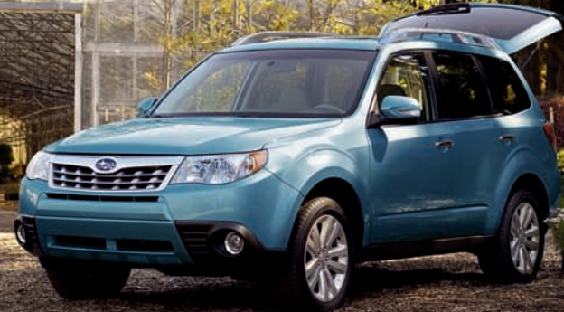
Forester 2.5X Touring in Sky Blue Metallic