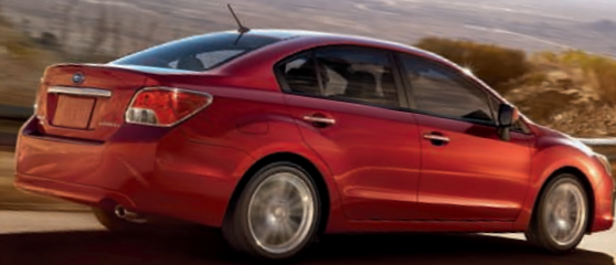
Impreza 2.0i Limited 4-door in Camellia Red Pearl.

"The most fuel-efficient All-Wheel Drive car in America at 36 MPG." 4 —U.S. Environmental Protection Agency